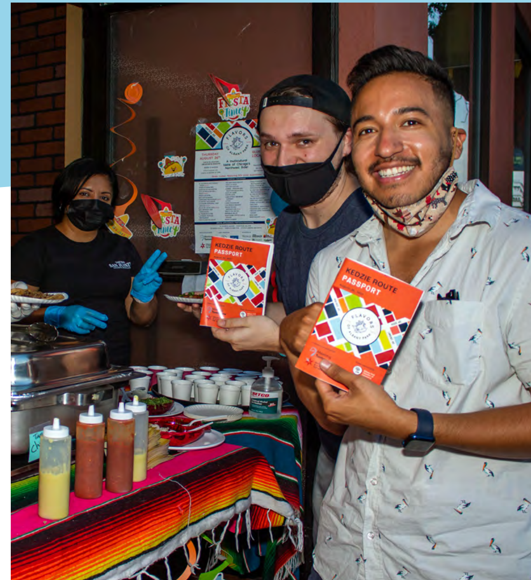
^ 2021 Flavors of Albany Park