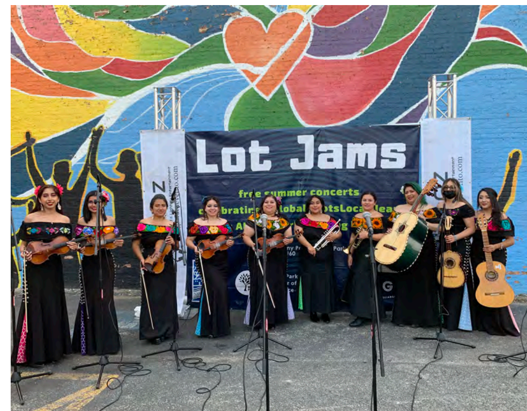
v Mariachi Sirenas at Lot Jams