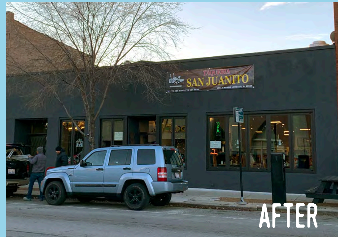
Taqueria San Juanito located at 4714 N Kedzie Ave received a 2021 Storefront Improvement Rebate