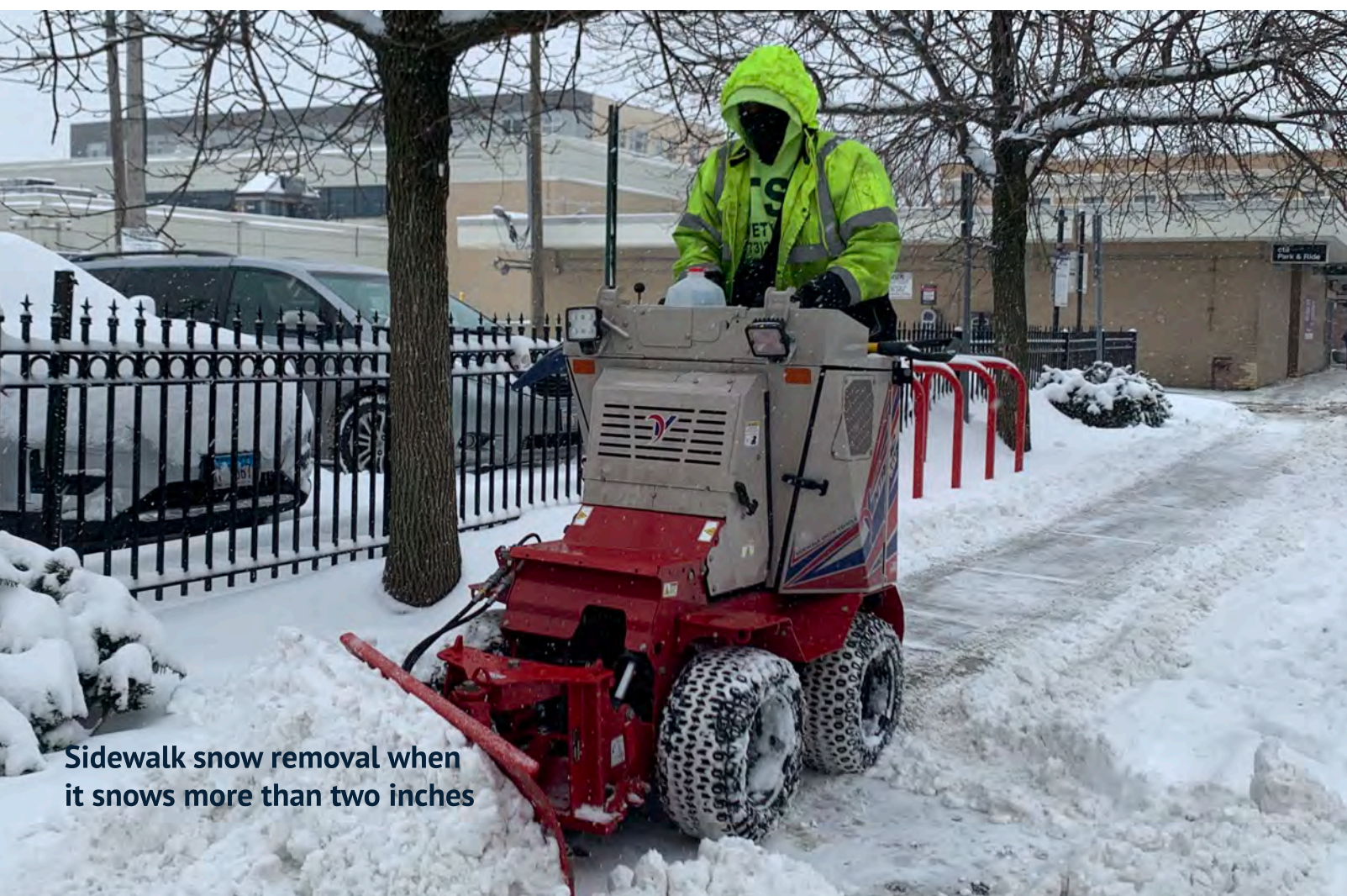
Sidewalk snow removal when it snows more than two inches