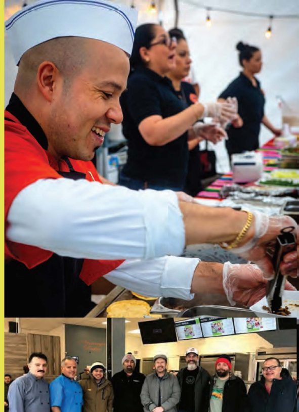
Local business owners representing 6 different businesses at the intersection of Montrose and Troy, who gathered to welcome Naranja Dulce to the district.

The SSA snow and salting contractor clears a 5-foot wide path along the 7.5 miles of sidewalks in the SSA. This service assists you in removing snow for public safety and commuting, but it does not replace your own responsibility to keep the sidewalks clear. Residents, customers, delivery staff, and employees all need a clear path on sidewalks, so please remember that snow removal starts with you.